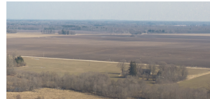
The village of Umbusi